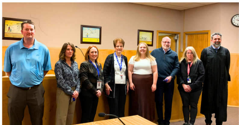
Judge Souza with newly sworn in Advocates in March 2022

-Honorable Judge Souza 13th District Court Judge of Yellowstone County